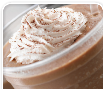
Creamy blended coffees