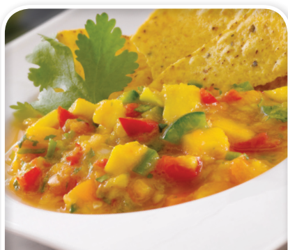
Perfectly chop ingredients